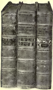
First Edition Encyclopaedia Britannica 1768

A book that lives—its eleven successive editions—the product of a serious co-operative effort by 1,500 specialists—written by authorities selected from 21 countries (214 Americans)—8 years in the making—cost $1,500,000 to produce—issued not volume by volume, but as a complete whole—most comprehensive in scope and detailed in treatment—a book of practical things as well as of learning—written in readable and interesting style—convenient for reference—provided with an index of 500,000 entries—of indispensable value to owners of the Britannica Year-Book.